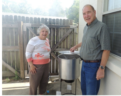
Article & Photos Provided by: Tambra Cabrera